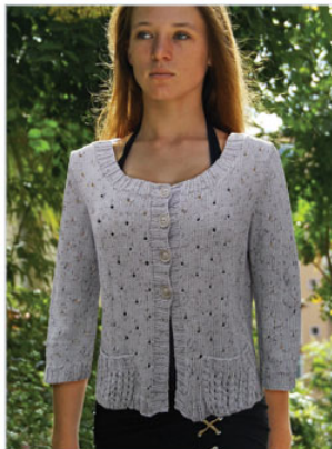
1656 POLKA CARDIE Sizes: 34 (38, 42, 46, 50, 54) in. 5 (5, 6, 6, 7, 7,) balls Ty-Dy Dots color Silver 947

Lastly, we are starting a series of weekly "Knit A Longs". Cost is $5 per week to come and knit with your instructor and friends on a specific project. Stop in the shop to see projects on display and upcoming dates.